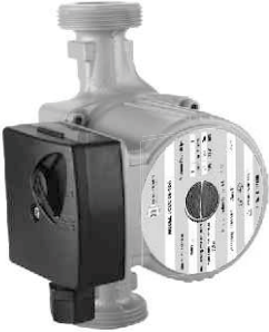
CCC 06-25A Capacitor : 3µf